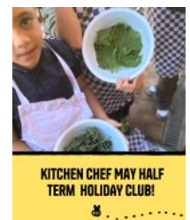
KITCHEN CHEF MAY HALF TERM HOLIDAY CLUB!

Places are limited, so we recommend booking as soon as possible! Click here to book